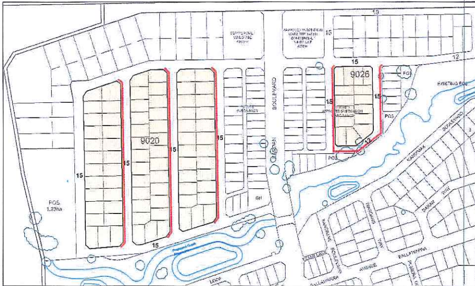
EXISTING LOCAL STRUCTURE PLAN - Scale 1:4000