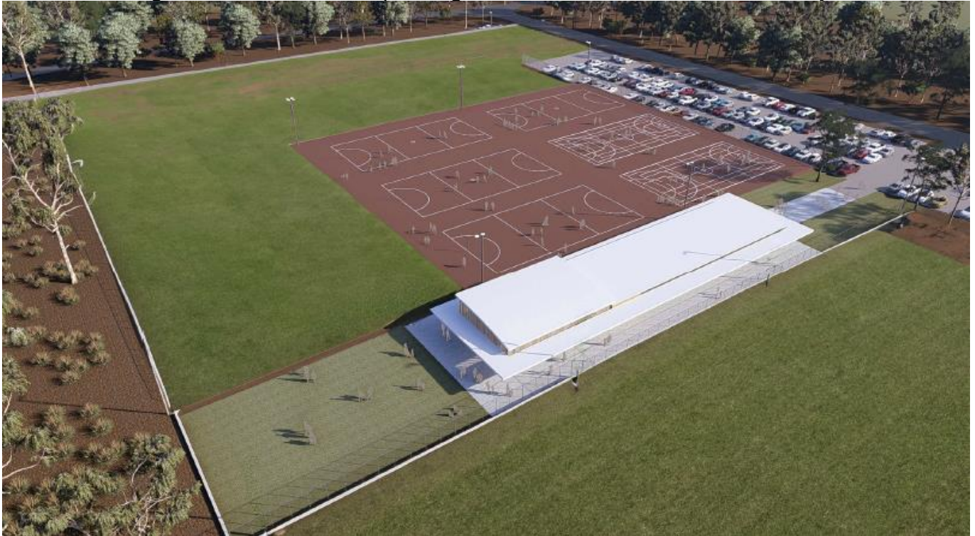
Stage 1 - 6 courts, pavilion, sports floodlights and carparking

The below images illustrate the concept design for the Keirnan Park Netball facility.