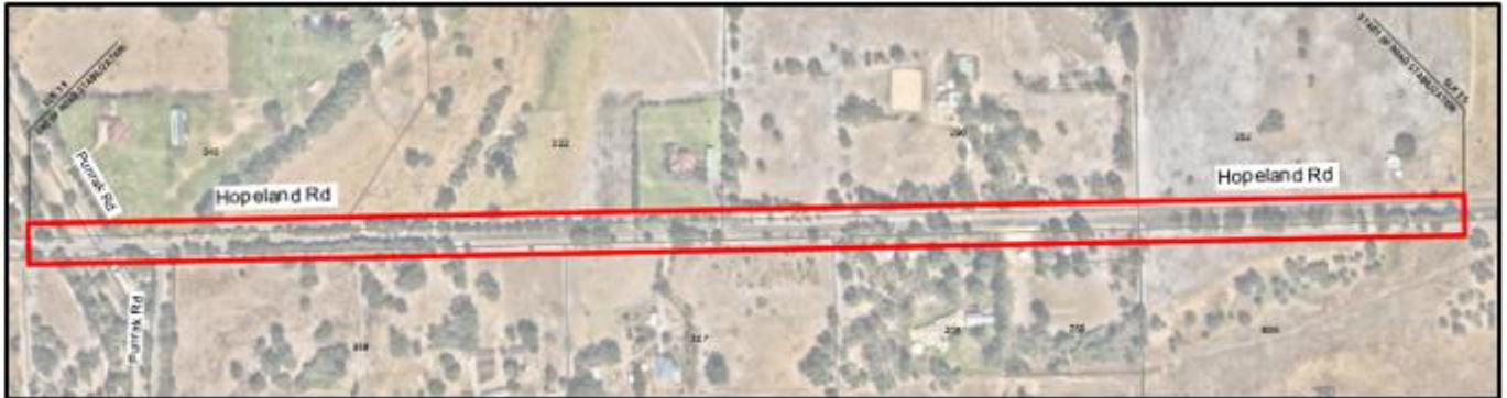
Figure 1: Hopeland Road A from SLK 2.5 to SLK 3.9

In the 2023/24 financial year, the Shire received funding approval through the MRRG Road Rehabilitation program to rehabilitate two sections of Hopeland Road. The sections are referred to as Hopeland Road A - from Punrak Road extending 1.4 km's North and Hopeland B - from Punrak Road extending 900 meters to the South. The funding applications were submitted as two separate projects, however the projects have been tendered and are to be delivered as one project. The sections to be rehabilitated are indicated in Figure 1 and Figure 2 below.