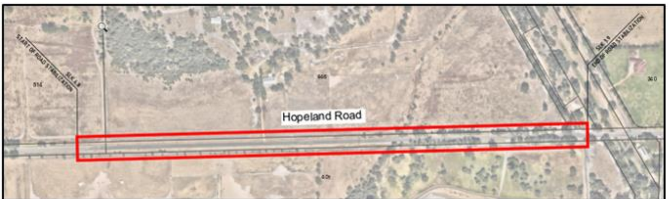
Figure 2: Hopeland Road B from SLK 3.9 to SLK 4.8

The 2023/2024 approved budget for the project was $950,500 ($545,400 for Hopeland Road A and $405,100 for Hopeland Road B). This project has been carried forward to the 2024/2025 financial year.