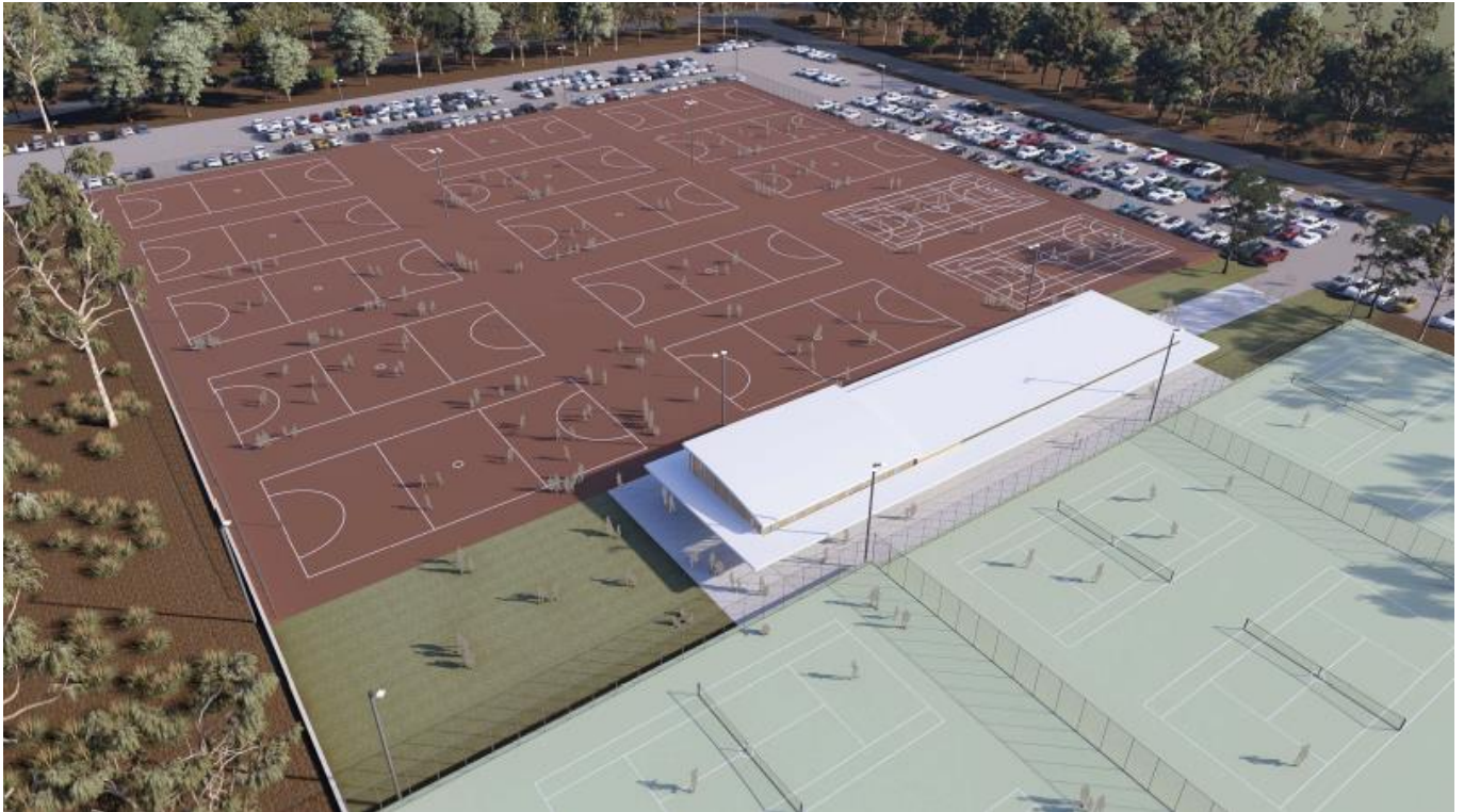
Stage 2 - additional 9 courts with an extended pavilion and additional sports floodlights,