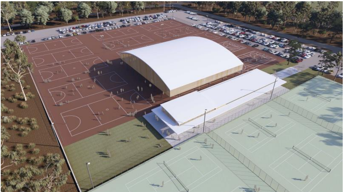
Stage 2 - additional 9 courts with an extended pavilion and additional sports floodlights,