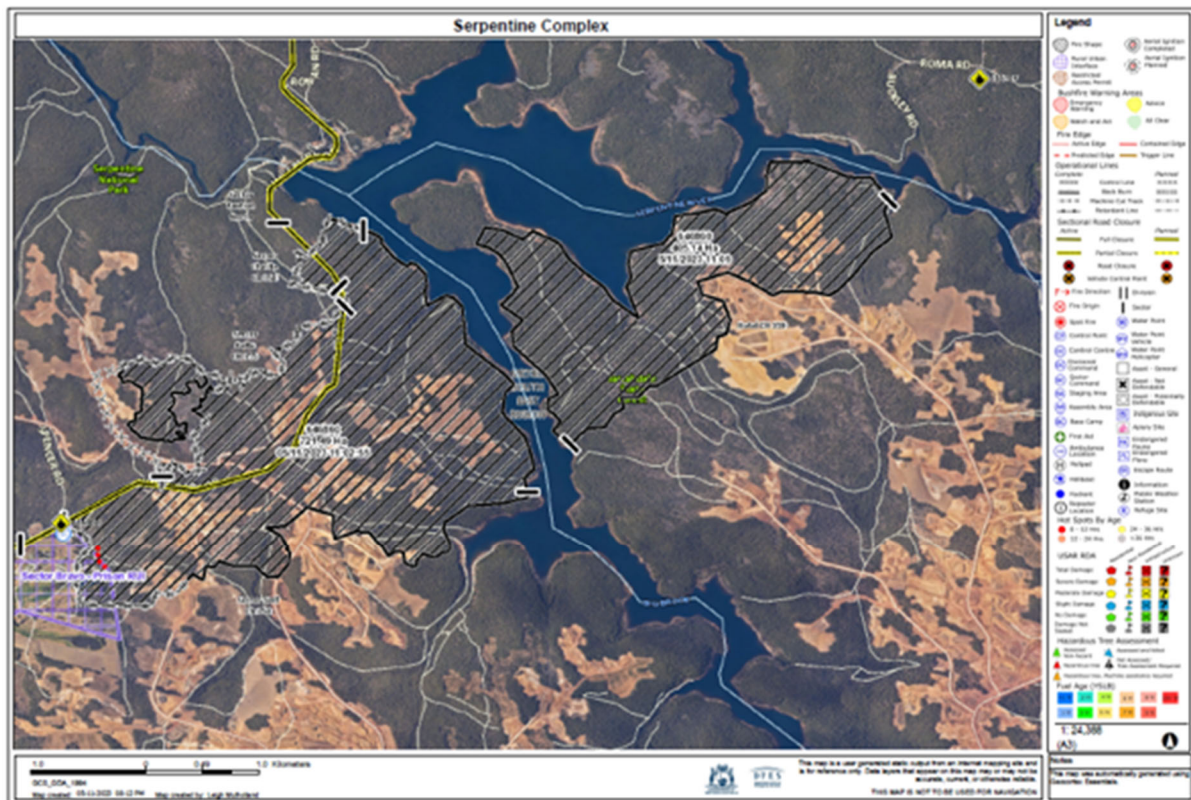
Figure 1 - Map 1 Serpentine Complex Bushfires

Thomas Road x Nicholson, Oakford: A 3rd Alarm, with no damages reported, caused by lightning.