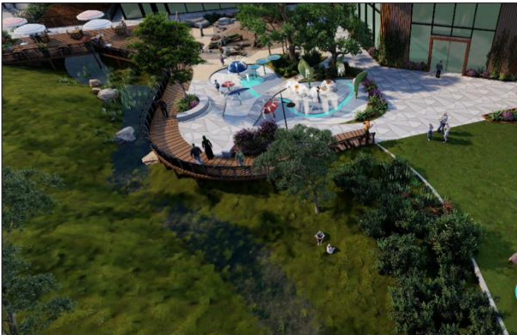
Figure 2 – Artist impression – Nature Play Splash Park

At the May 2021 Ordinary Council meeting, Council adopted the Byford Town Centre Civic Site – Concept Master Plan. The Master Plan identifies a range of mixed primary and secondary uses to be delivered on the site, such as the future library and Byford Health Hub, with the Nature Play Splash Park proposed to be located at the northern end of the site.