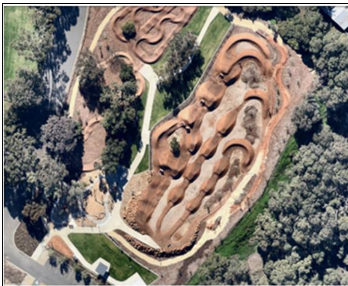
Figure 3 – Pump Track – John Dunn Challenge Park