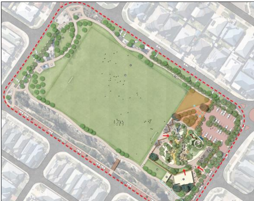
Figure 1 – Byford Nature Splash Park Master Plan

In August 2019 the Shire engaged UDLA to undertake a Concept Design Report to support the development of the future Bill Hicks Community Space for the Nature Play Splash Park at Bill Hicks Reserve, Byford. The estimated project cost at the time was $2.6m.