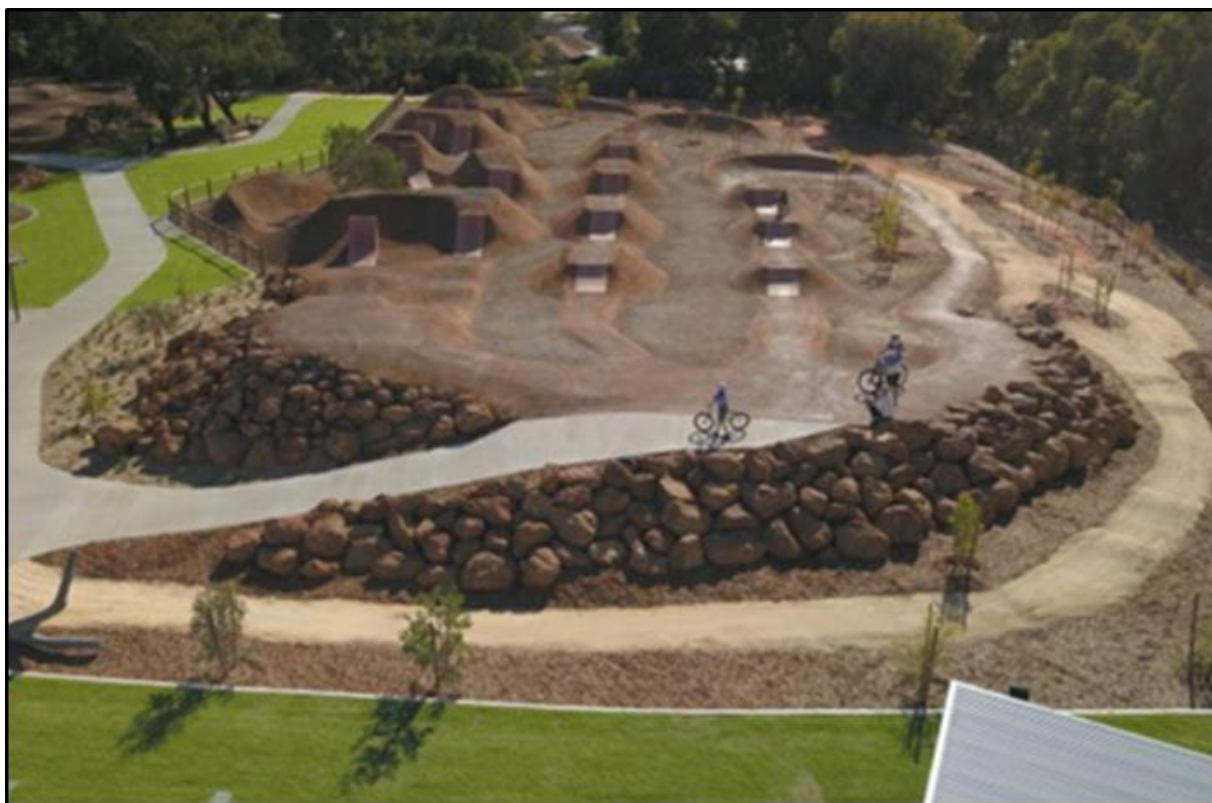
Figure 4 – Pump Track – John Dunn Challenge Park